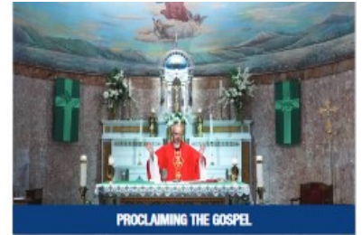
PROCLAIMING THE GOSPEL