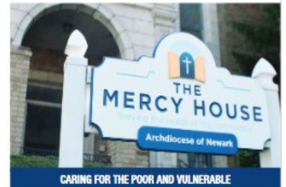
CARING FOR THE POOR AND VULNERABLE