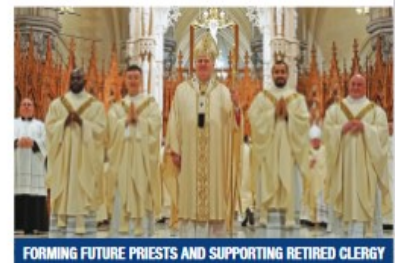
FORMING FUTURE PRIESTS AND SUPPORTING RETIRED CLERGY