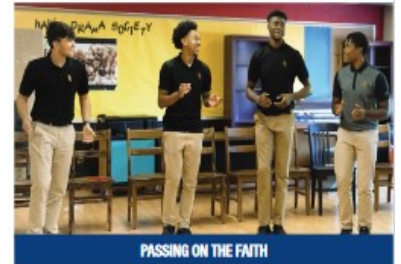
PASSING ON THE FAITH